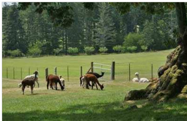
Alpaca Farm, Martha's Vineyard

Farming on the Island is not limited to vegetables. For example, at Allen Farm Sheep and Wool, you can purchase wool products. And at Chicama Vineyards, you can select wine produced from grapes grown on the Vineyard.