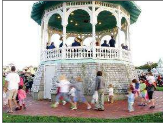
Vineyard Haven / Oak Bluffs Band Concerts