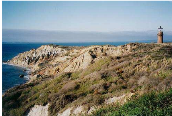
Gay Head, Martha's Vineyard

The Gay Head Cliffs are a National Landmark and for years were a favorite for those wanting a challenging climb from the beach at the base. Today, however, climbing is off limits due to the erosion toll this activity was taking on the face of the cliffs.