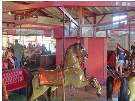
Flying Horses Carousel

The Flying Horses Carousel is open daily during the summer and on weekends in the spring and fall. Rides are just $1.50.