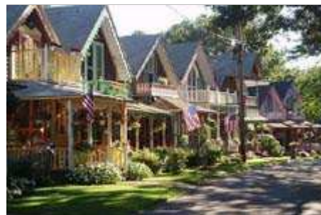
Cottage City, Oak Bluffs

The Martha's Vineyard Campmeeting Association, known as "the Campground" or "Cottage City," is a National Landmark located in the center of the town of Oak Bluffs. Consisting of hundreds of imaginative and colorful "gingerbread" cottages, the community contains the most perfectly preserved collection of Carpenter Gothic style architecture in the world. These truly unique Victorian "gingerbread" cottages are just a stone's throw from the famed Tabernacle.